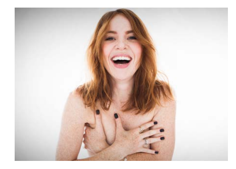
Angela Scanlon Full Frontal