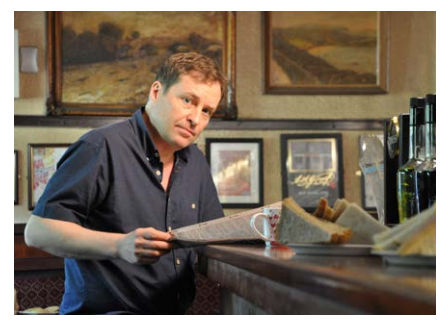
Guess Who's Dead

were strong, original education formats that played successfully in competitive slots.